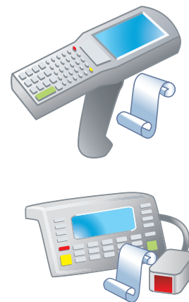
Voice Emulation Using client-side script

No Additional Network Traffic No Voice Server Hardware Required No User Profiles Required